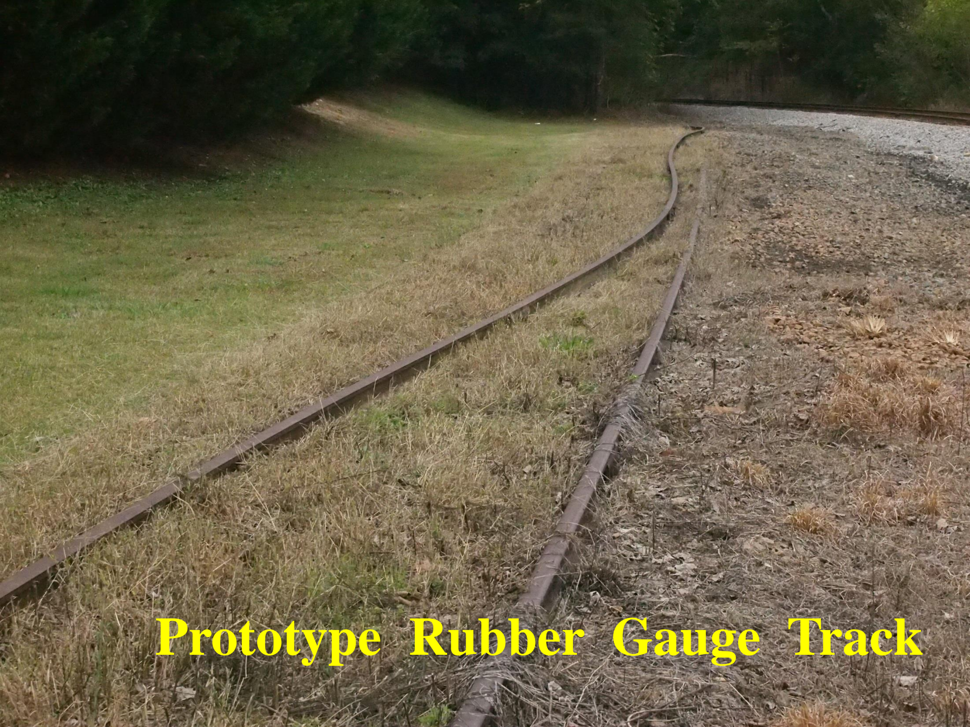
Prototype Rubber Gauge Track